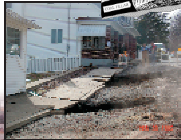
Illustration of Sinkhole Subsidence.

Sinkhole subsidence occurs in areas overlying underground mines which are relatively close to the ground surface. This type of subsidence is fairly localized in extent and is usually recognized by an abrupt depression evident at the ground surface as overburden material collapses into the mine void. Sinkhole subsidence is perhaps the most common type of mine subsidence and has been responsible for extensive damage to many structures throughout the years.