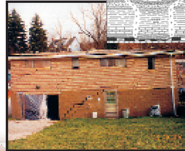
Illustration of Trough Subsidence.

Subsidence troughs over abandoned mines usually occur when the overburden sags downward due to the failure of remnant mine pillars or by punching of the pillars into a soft mine roof or floor. The resultant surface effect is a large, shallow yet broad depression in the ground which is usually elliptical or circular in shape.