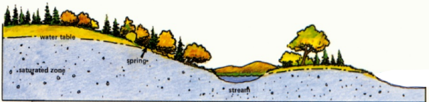
Possible groundwater discharge locations are springs, streams and lakes.