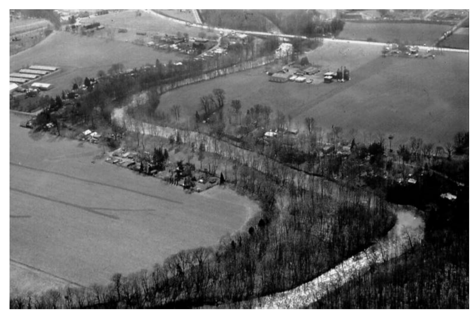
A range of streamside buffer conditions occurs adjacent to mixed land uses along this stretch of the Maiden Creek near Berkley, Berks County. (photographer - Patricia Pingel, DEP).