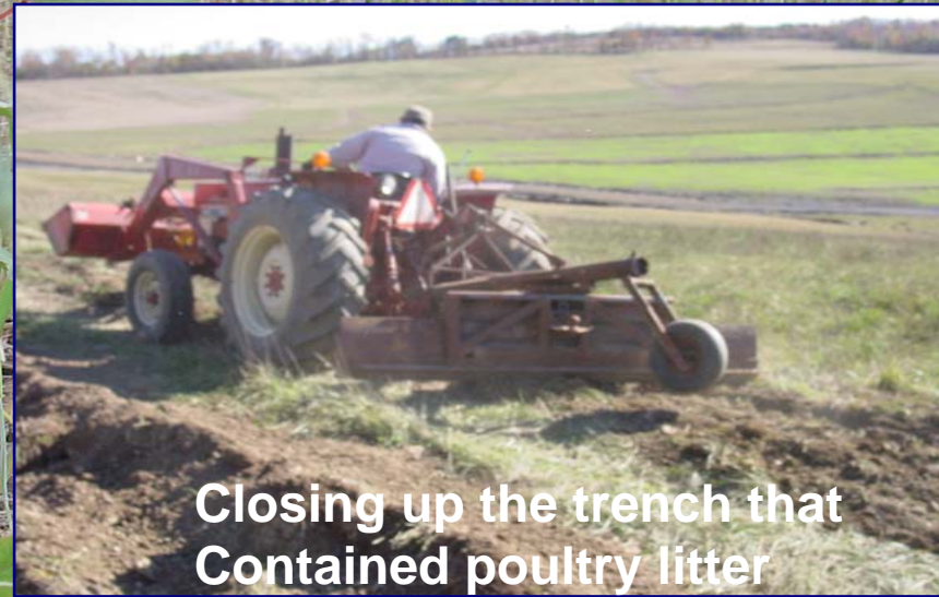
Closing up the trench that Contained poultry litter