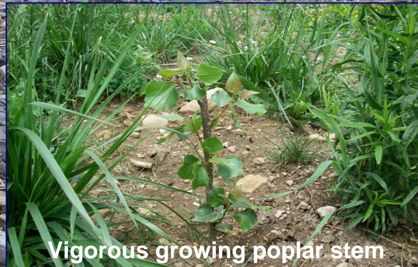
Vigorous growing poplar stem